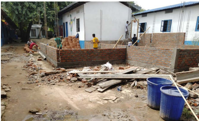
Construction of the kitchen-dining-room at Parijat Academy (Sep 2024 photo)

The photo below shows the construction of the kitchen-dining-room at the Parijat Academy at its initial stages.