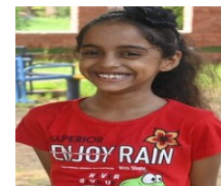
A..... is a 3rd grade student.

The support for these 6 children is being provided at about $2,100 per year.