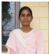
A....., selected in 2019, and daughter of a tractor driver father and agricultural laborer mother, finished her B.Sc. in '24; preparing for a bank job exam [Dec 2024 photo]

A total of 11 good students entered the program, which ceased taking new students after 2023. An update on four “successes”, and one student who represents the rear guard are below.