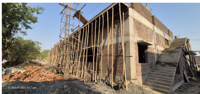
Kitchen and Dining Hall to Serve over 700 Girl Students Under Construction at Rajkot, Gujarat (March 2025 Photo)

Photo below shows the kitchen and dining hall under construction in March 2025.