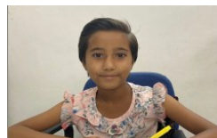
P..... is a 3rd grade student.