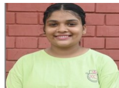
A..... is an 11th grade student.