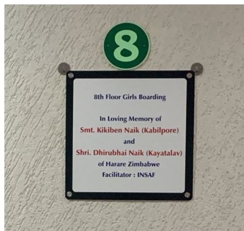
Dedication Plaque in Mumbai Hostel (Dec 2024)