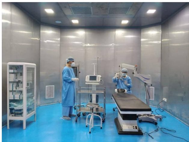
A View Inside the new Operating Theater in the new Nanritam building at Purulia, West Bengal