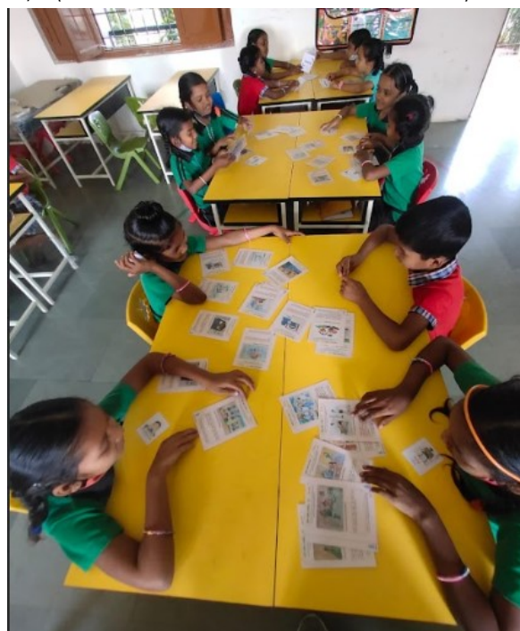
A scene from a classroom at Shantaba Vidyalaya

Another major use was to support the operations at the Vidyalaya (food & nutrition, teacher's honoraria etc.)