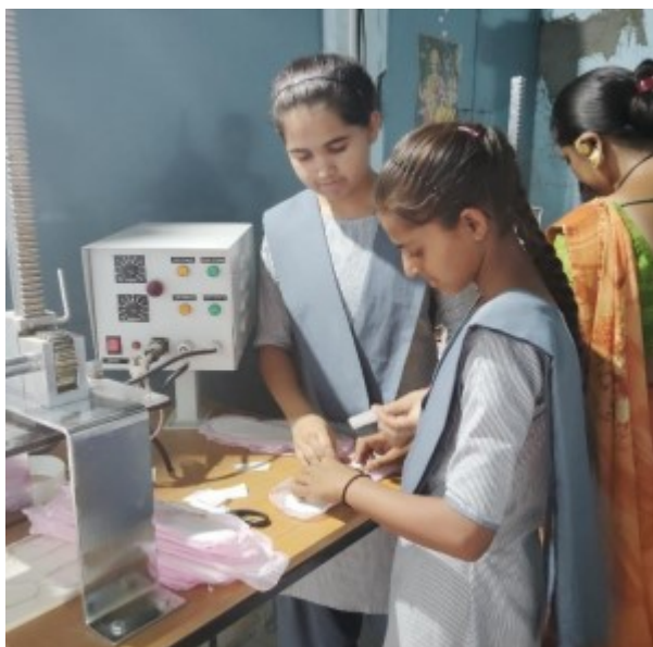
Students learning to make sanitary pads

One noteworthy project was the on-hand learning of sanitary pad making and the addition of a much-needed girls bathroom at a school in Bhavnagar district.