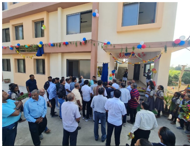
Inauguration of the new Girls Hostel

About $14K of the grants were used to support the higher education of 13 students as about 36% of the students are orphans or children of single parents. Another $10K was used to support the construction of a new hostel for girl students.