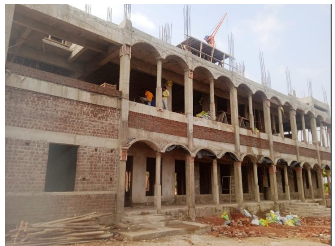
A View of the Dining Hall and Activity Center in Aug 2024