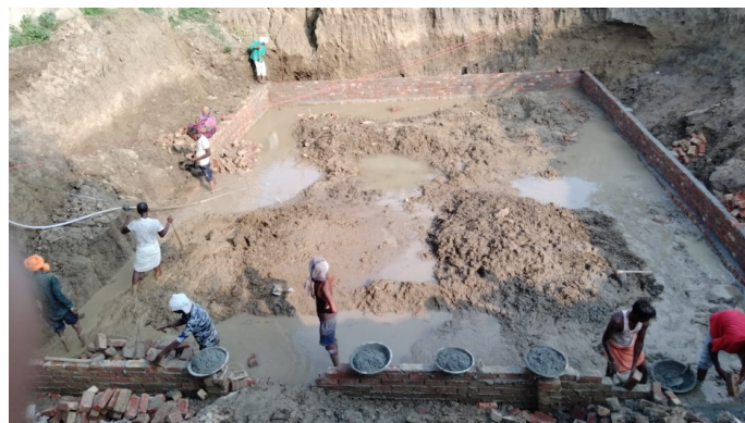
A View of the CERI Building Construction Site (Sep 2024)

The construction of the CERI building has started as of September 2024 (photo below).