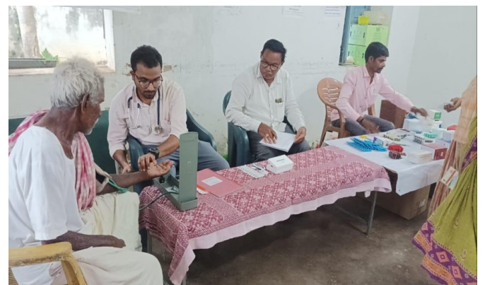
A View of the Monthly Health Clinic at Village Ramalingapuram, attended by 40-50 patients each month

Two other programs are aimed at rural community primary health care. One program, sponsored by 4 families with $4,485 in 2023, helps pay for 20 commonly needed medicines for several villages. Another program, sponsored by 8 families with $1,480 in 2023, helps pay for one periodic health clinic.