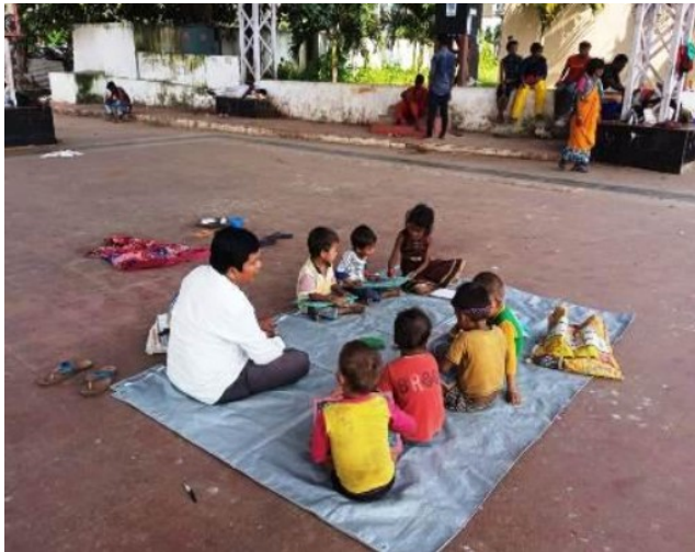
A View of the Platform School, Bhubaneswar (Railway Platform was under repair at the time of the photo)

Seven INSAF families have been sponsoring a program in Bhubaneswar and Paradeep in Odisha for remedial education of children from desperately poor parents. Some of these are children who are found around the railway station in Bhubaneswar. Some come from a slum near the railway station at Paradeep. In 2024, a grant of $6,975 was sent, thanks to the 7 INSAF families. In 2023-24, the program had 56 children (21 girls) with 85-90% attendance.