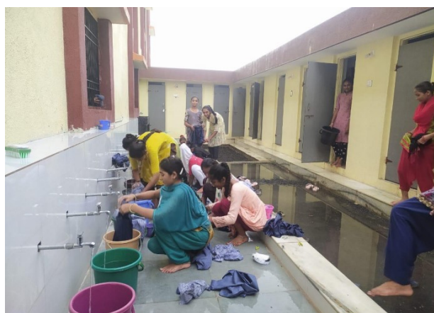
Students making use of their new bathroom

The Foundation awarded scholarships adding up to over $30,000 needy students at the school and college level. More information is at kanchanfoundation.org.in .