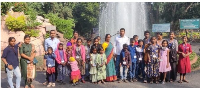
Special one-time Excursion to Bhubaneswar Zoo for Motivational Purposes (Dec 2023)