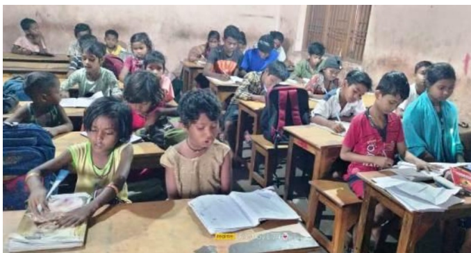
A View of the Paradeep Education Center