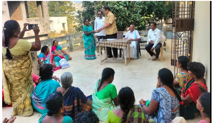
A SHG Meeting at the Sodhana Office in Chipurupalli, A.P.

Several INSAF families have been supporting 7 different programs with Sodhana in A.P. One of those programs is Women's Empowerment, sponsored by 4 families. Under this, coordinators organize and support women's Self-Help Groups (SHGs) to receive and pay back microloans from government-owned banks. About $2,830 was spent on this program in 2023.