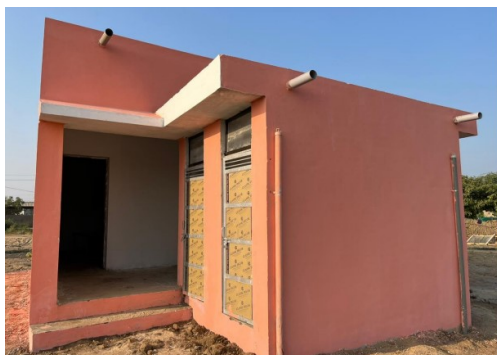
A Typical New Home