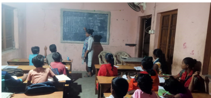
Paradeep School in session in September 2022

On October 18, 2022, 19 children were present at the Bhubaneswar School.