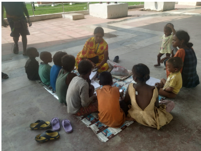
Bhubaneswar school in session in June 2022

About 7-8 INSAF families have been supporting two informal schools in Odisha — a Platform School in Bhubaneswar, and an after-school education center in Paradeep. During the times when Covid cases were high and the train traffic had been suspended, the attendance at the Bhubaneswar School had dropped significantly even though the Paradeep center attendance stayed almost even. We are happy to report the attendance at both schools has returned to almost normal.