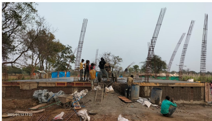
A view of the Vocational School Construction Early in 2022

The total cost of the vocational school project is projected at Rs. 1.9 Cr (about $250,000). This does not include the annual operating cost which will include the expenses for a dedicated coordinator, and a caretaker for the Visitor's Guest House.