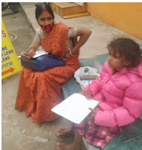
Platform School as a Footpath School (Nov. 2021)

During Covid19, the Ruchika-INSAF teachers have been teaching the children in 3-4 small groups on a nearby footpath. Photo below shows a session with a child wearing her new jacket provided by our program.