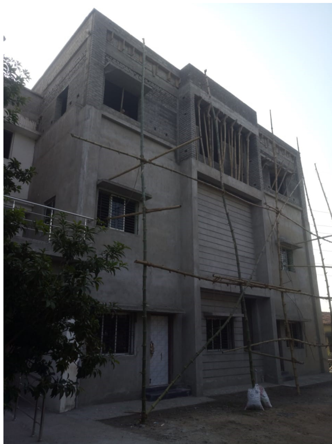
A view of the Eye Hospital Site Construction in-progress

The project has already accomplished the construction of a new operating theater complex and staff quarters. The current phase has the goal of adding a 3,200 sq ft. third floor, which would have 12 cabins and a dormitory for patient recovery. Private cabins will bring in revenue from paying patients to Nanritam, which will help subsidize the costs for treating the underprivileged.