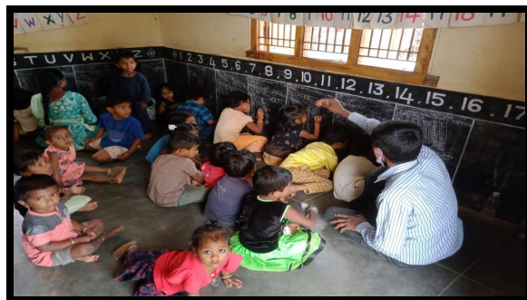
Learning How to Write (Chukkavalasa, A.P)

Recently, half-yearly marks for the students in the 5 adopted schools were compared with another set of 5 non-adopted schools. to document the effectiveness of the program. The 5 non-adopted schools had 96 students in LKG-2nd grade, 48 male and 48 female.