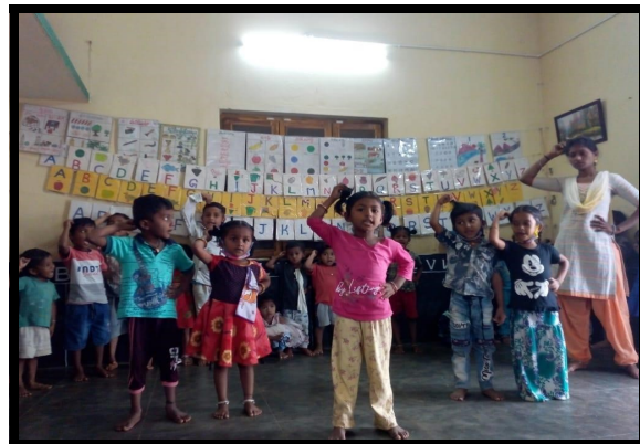
Learning Parts of the Body (Mettapalli, A.P.)

The 5 Sodhana-INSAF adopted schools, located around Chipurupalli, A.P. have a total of 119 students in LKG through 2nd grade, 56 male and 63 female.