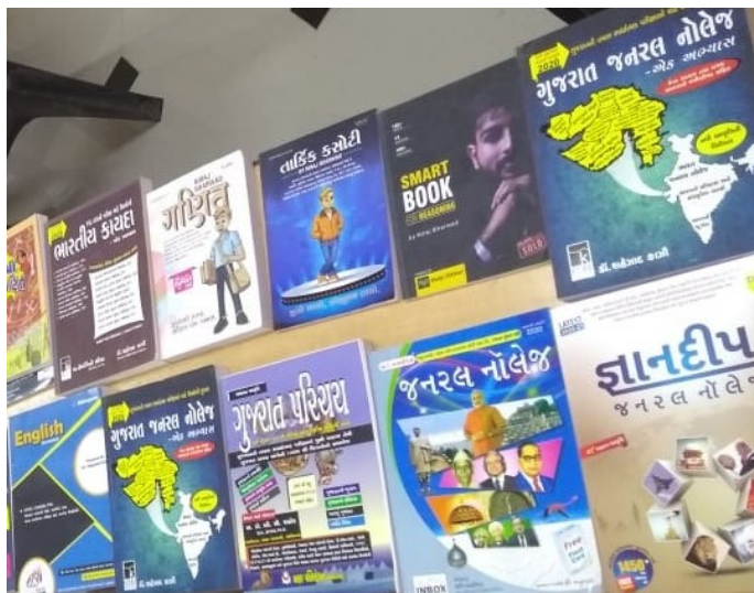
A sample of books donated at a cost of about $195 to help students in Pachhegam prepare for competitive examinations