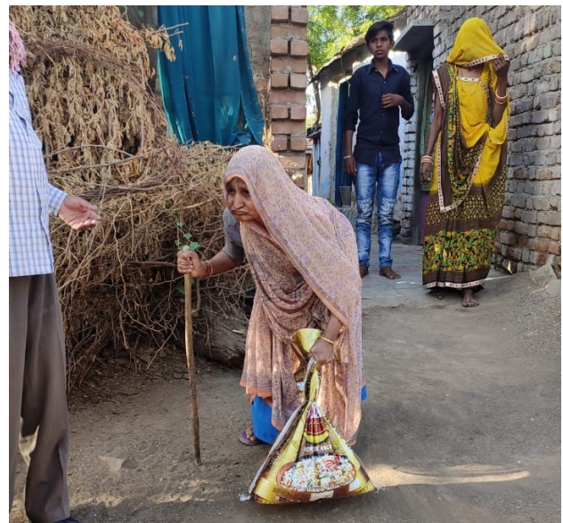
Grocery Distribution in Pachhegam, Gujarat