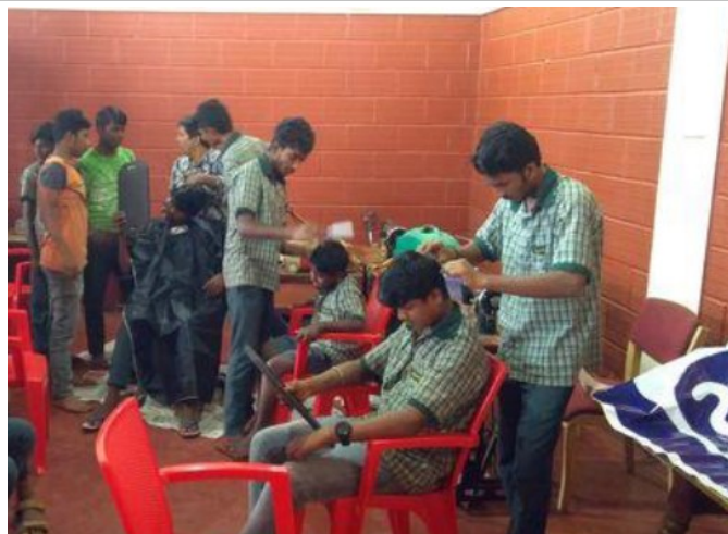
Kaliyuva Mane students learning hair cutting (2020-21)

More information is at http://divyadeepatrust.org