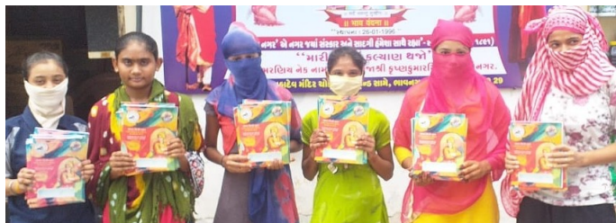
A few students after receiving notebooks at a school in Gujarat