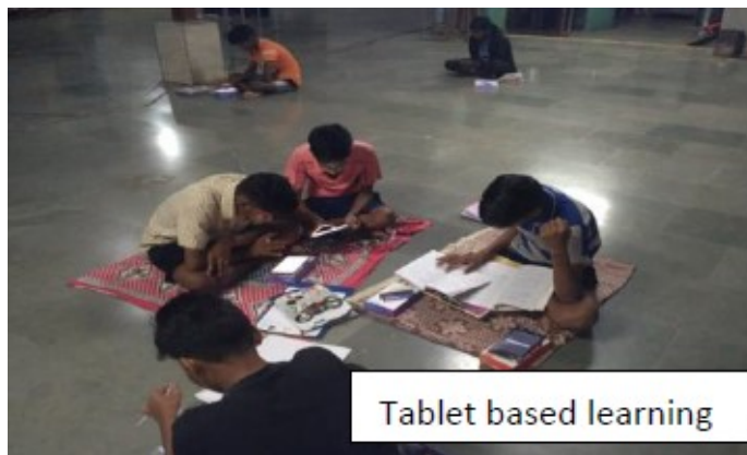
Tablet based learning