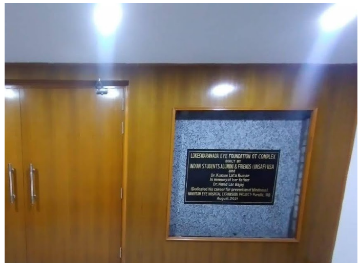
Main Entrance Plaque Recognizing INSAF (2021 Photo)

A patient recovery ward is currently being built and is expected to be completed in June 2022.