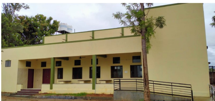
Front view of the new dining hall and male staff quarters (2020-21)