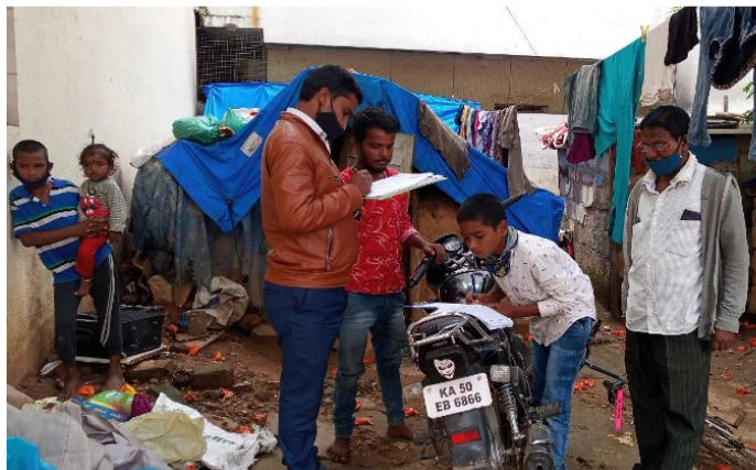
An Assessment of skills in-progress for a child (Pratham Mysore 2020-21 Annual Report)

With funding from several Rotary Districts and another US non-profit, Pratham Mysore also implemented an English literacy improvement project in 11 blocks of Karnataka. The project reached over 12,000 3rd-8th grade students in 200 government schools. It made good use of SMS and WhatsApp media and community participation, and resulted in significant improvements in English skills as shown by various assessments.