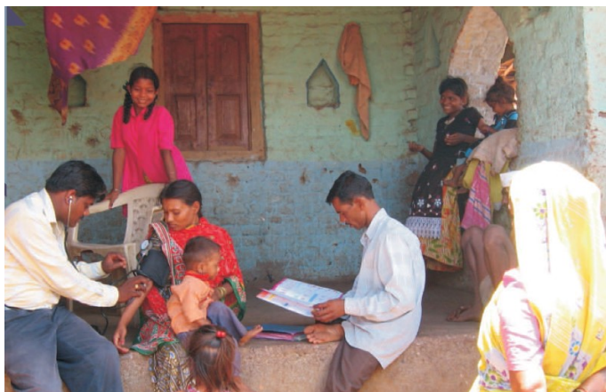
Health check-up being performed on a mother in Valsad Dist.