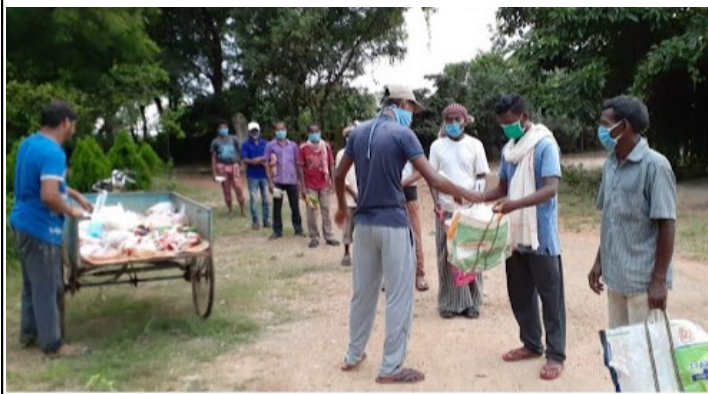
Nanritam distributing ration supplies in one of their many Covid relief activities

The above Yr 2021 donations bring the total amount of Covid relief funding to $133,903. Many thanks to the donor INSAF Members and Friends for their generosity.