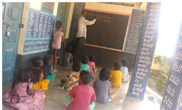
A volunteer teacher in a class (2020-21)