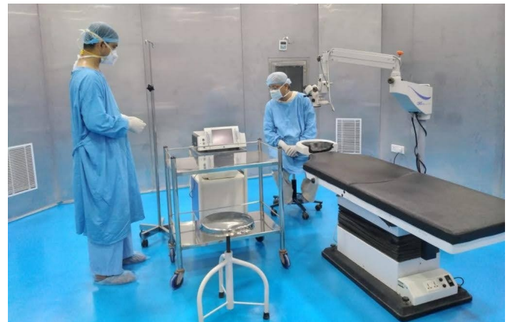
A view inside the new operating theater (2021 photo)

Under this program, a brand new unit of operating theater complex and staff quarters for volunteer doctors and paramedical staff have been completed on an excellent timeline by August 2021.