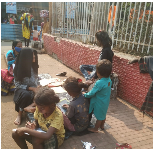
Platform School as a Footpath School on March 24, 2021

Covid19 caused the railway trains in India to stop or run intermittently, making the rail platform lose its relevance for the children. However, the Ruchika-INSAF teachers have bravely carried on (picture below), teaching the children in 3 batches per day on a nearby footpath.