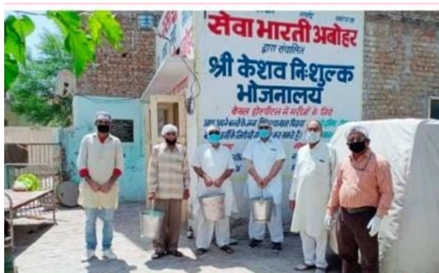
A sign in Hindi, "Seva Bharti Abohar, Sh. Keshav Free Kitchen, only for the hospital patients"

Among Seva Bharti's activities are the operation of a kitchen at the local govt. hospital, where Seva Bharti provides 3 hot meals a day for the patients. In addition, Seva Bharti operates a mobile library named Swami Vivekanand Library at the hospital and at J.P. Park in Abohar, a sewing training school for women, and a homeopathic dispensary. They are hoping to open a computer learning center for children from poor families.