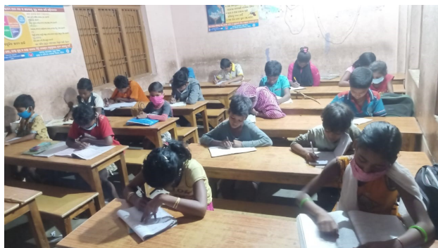
Paradeep Center on March 4, 2021 despite Covid19 pandemic

The Paradeep Center has also continued to function as much as is practical, shown in a photo below.