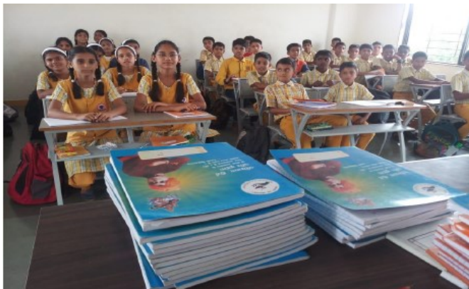
Distribution of notebooks at an Education Center in District Raigad, Maharashtra in June 2019