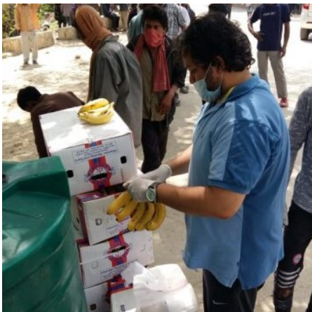
Goonj distributed ready-to-eat meals for migrant workers stuck in Delhi during the Mar-Apr 2020 shutdown. Meals included Bananas from Maharashtra donated by a volunteer