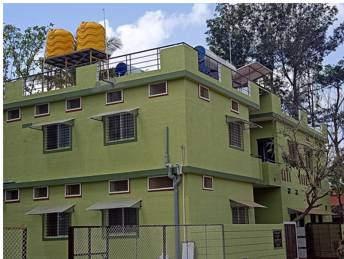
A View of the new dormitory (Aug 2020)

A new kitchen and dining facility, along with modern living accommodations for 7 male teachers, is under construction and progressing well. The new facility will allow over 75 persons to dine at one sitting,