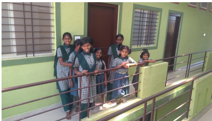
Students inside the New Girls Dormitory (Aug 2020 photo)

Planting of more trees and addition of an access pathway paved with interlocking blocks are also planned.