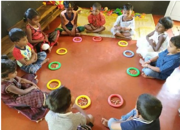
Pre-school Children Learning via Practical Exercises (Pratham Mysore 2019-20 Annual Report)

On average, the program has succeeded in improving social-emotional, cognitive, language, and math development, rising from 16-30% to a level of 86-93%.