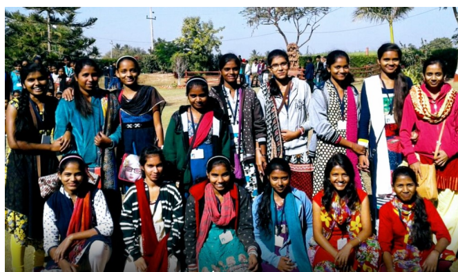
Students at the Shantaba School