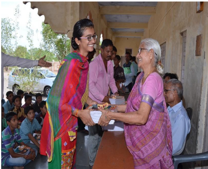
The photo above is from a function during 2017-18 to distribute notebooks and other materials to students.