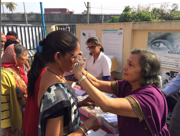
Photo from the Jan 28 eye camp at Vesma, Gujarat