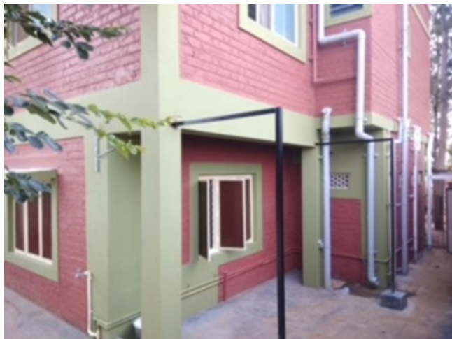
Boys Dormitory after Phase 1

The goal in recent years has been to convert Kaliyuva Mane to a fully residential school, since practically all the kids come from extremely poor and often broken families which don't provide a conducive environment for a growing child. Phase 1 of this infrastructure, to construct a dormitory for boys and caregivers with accommodation for 72 children, was completed earlier this year.