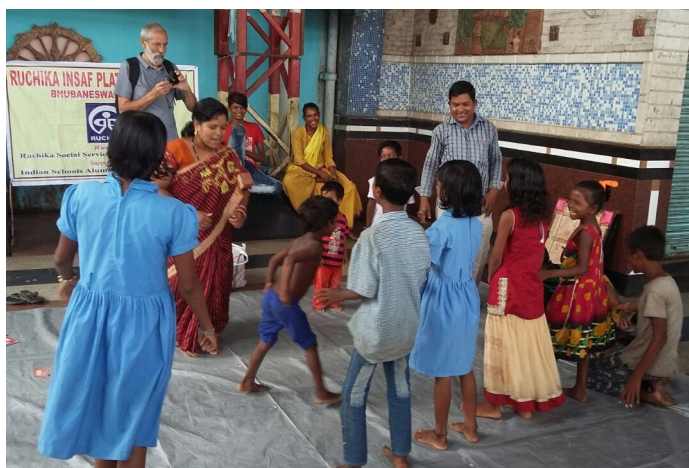
A session at the Bhubaneswar Railway Station. A Ruchika-INSAF School banner is in the background