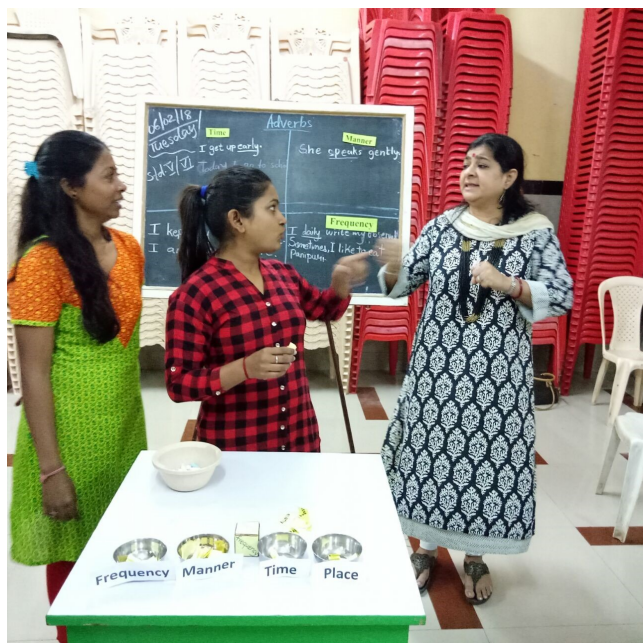
Shantaba School Teachers Receiving Training in Mumbai