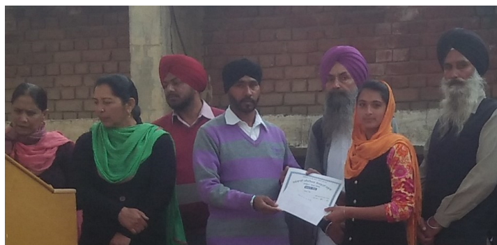
One of the students receiving her award

Classes 6-10 are boys only at this school. Classes 11-12 are co-ed, and 12 students from classes 11-12 were recognized — 6 from the arts stream, and 6 from the science stream. Incidentally, male and female students performed equally well this year.