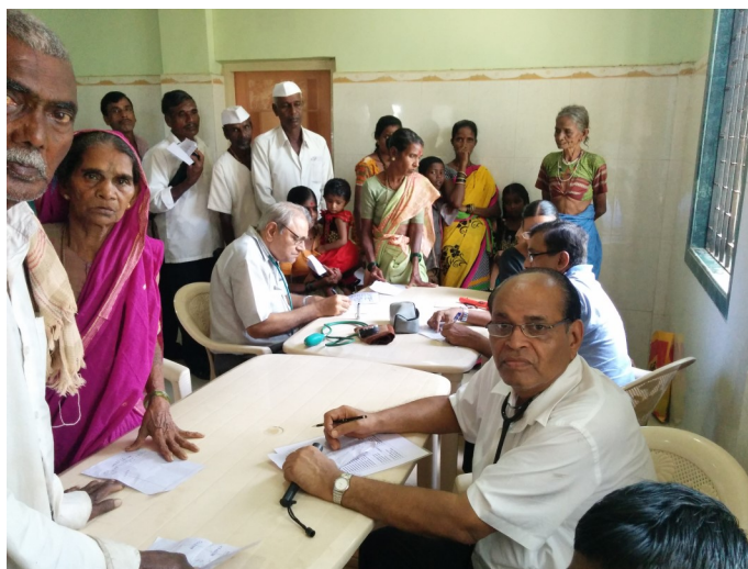
Patients at the Adivasi Unnati Mandal Health Clinic at village Taki Pathar in Maharashtra