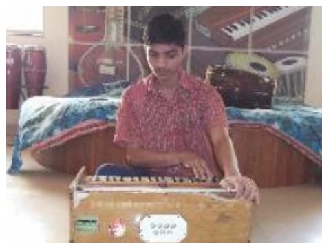
A developmentally disabled student performing on harmonium