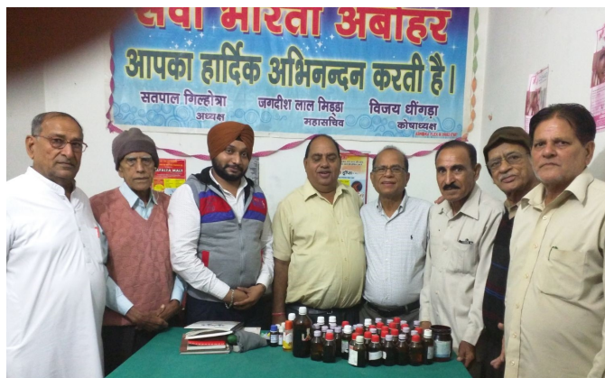
Seva Bharti Center in Abohar, Punjab with medicines meant for distribution to the needy (Nov 2017 photo)