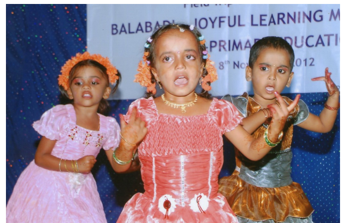
Photo shows children from an INSAF sponsored pre-school, performing at a workshop on pre-primary education in A.P. India