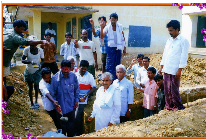
Foundation stone being laid with local community leaders.

A small group of INSAF families has "adopted" a small village, Ramalingapuram in Andhra Pradesh with the intent of a long-term commitment. During 2006-2007, a classroom as shown below has been added to the Primary School at a cost of about $4,450.