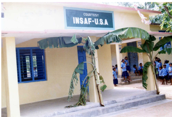
A view of the finished product — the new room is ready.