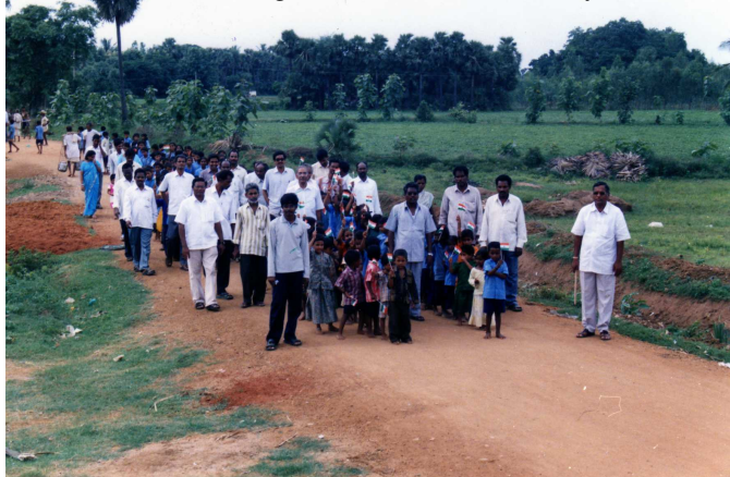
Village procession on the occasion of inauguration.